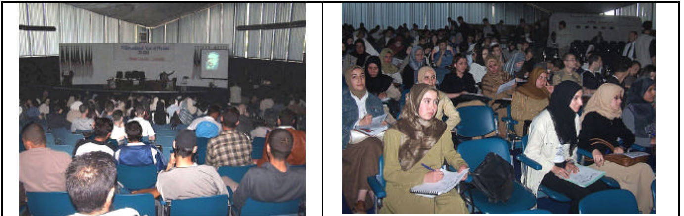
A rich program of activities was carried out at Mentouri University, Constantine

It seems that the main activities took part in the Eastern region, notably at Mentouri University at Constantine and at Annaba University.