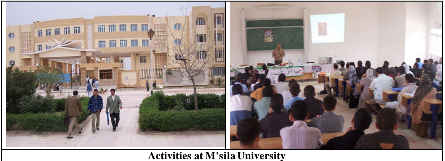
Activities at M'sila University

http://www.univ-tlemcen.dz/manifest/physique/phys.htm