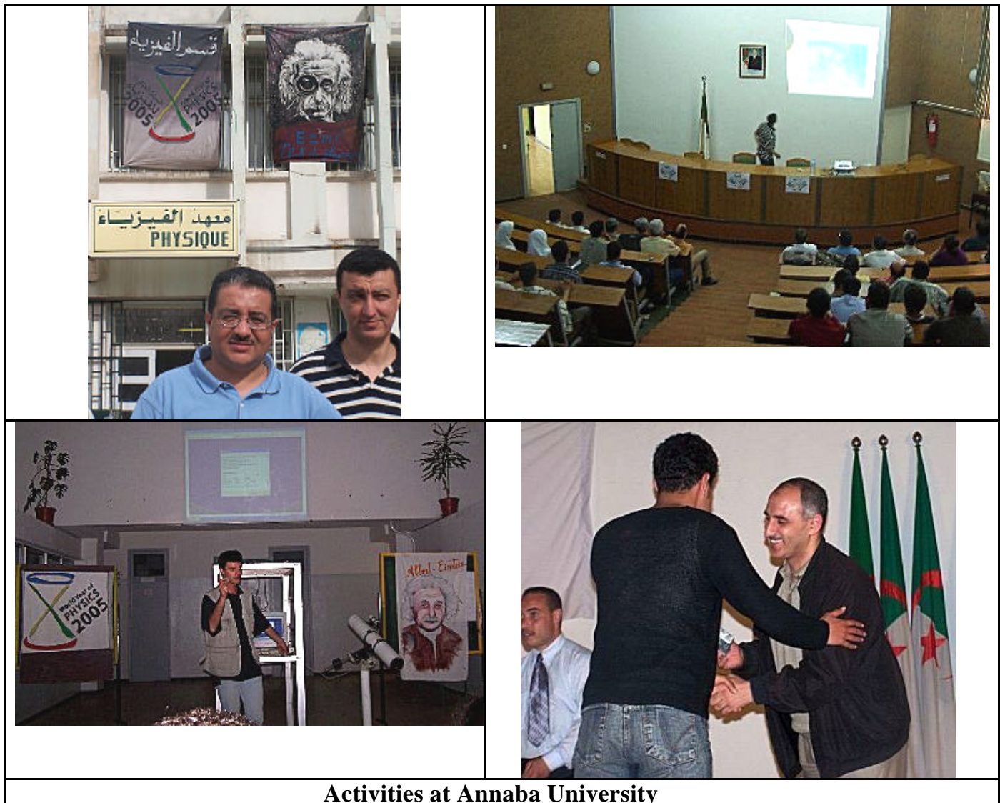
Activities at Annaba University

The Physics Department at Annaba Univ. also carried out a year long series of lectures and other activities with invited guests from all over the country and abroad (More at http://www.geocities.com/mentouri05/annaba.htm ). Some public lectures were also organized by the physics departments of universities at Béjaia and M'sila.